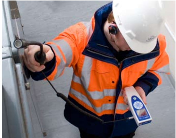
Optional external microphone extends reach.