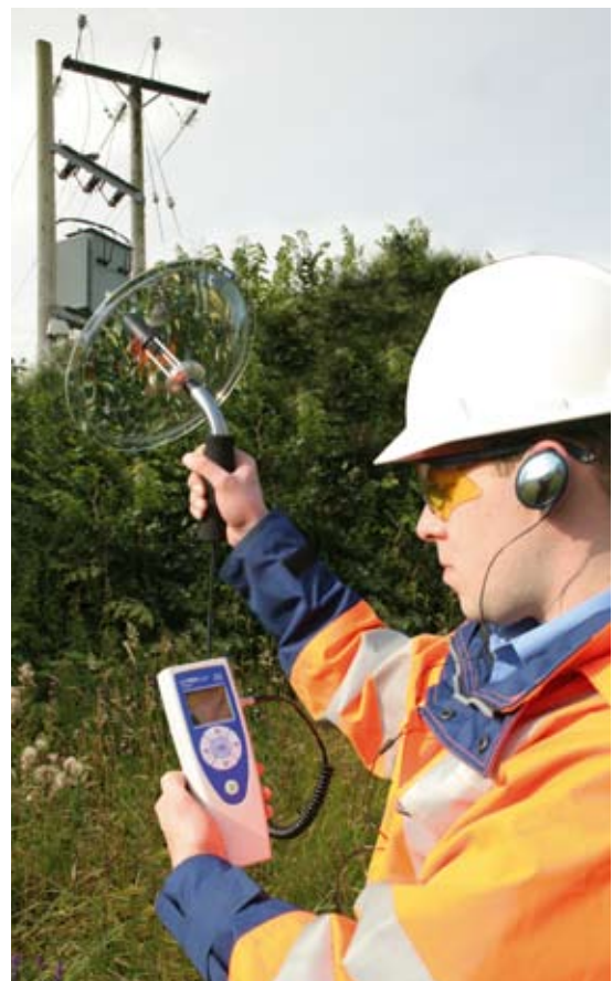
Listen for PD activity in overhead assets with the UltraDish™ add-on.