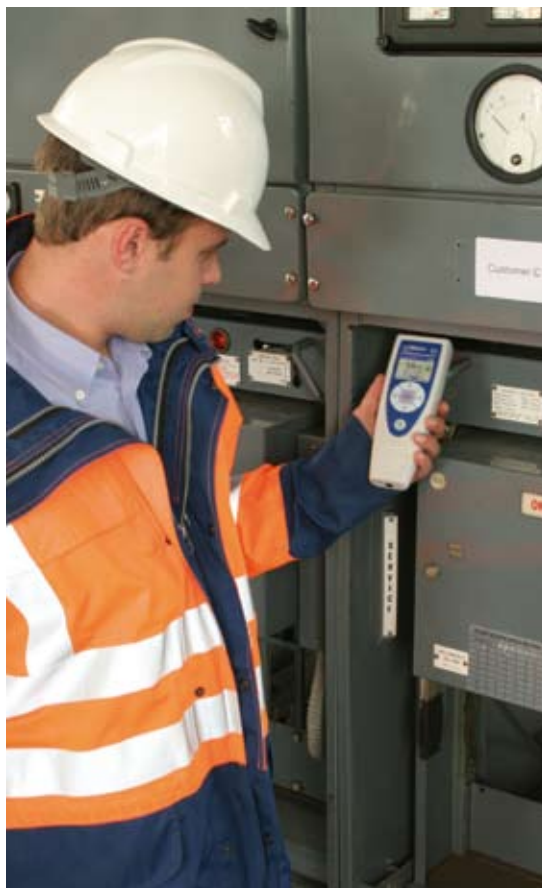
Check partial discharge activity on the surface of assets and internally.