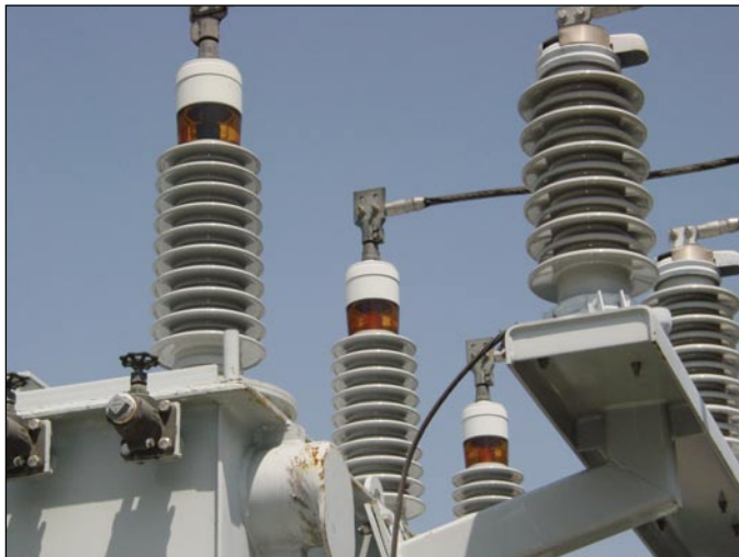
The dark discoloration of the closest internal bushing conductor indicates a potential serious problem in this large substation transformer.

The picture below shows severe color differences between the closest internal bushing conductor compared to the other two phases. This transformer was only a few years old, and utility personnel entered the substation on a daily basis. However, routine visual inspections along with other maintenance procedures were being deferred due to the utility's need to focus resources on new construction activities related to a sudden local economy boom. The problem was only detected by the casual observation of an outside testing agency's technician who was present on an unrelated switchgear cable problem. After this picture was forwarded to the transformer manufacturer, a new bushing was immediately on its way to the utility at no charge. This casual visual observation by the trained eye of a conscientious technician may have saved the utility millions of dollars, had catastrophic bushing failure occurred.