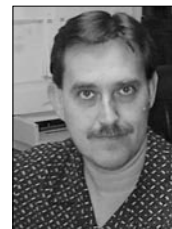
by Don A. Genutis Hampton Tedder Technical Services

THIS IS THE FIRST IN A SERIES OF REGULAR ARTICLES that focuses on electrical inspection methods and technologies that are performed while the electrical system remains energized. Although no-outage inspections can be very valuable tools, always remember to comply with the appropriate safety guidelines when conducting inspections.